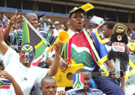
South African Fans

Hooligans are people known to participate in destructive and troubling behavior in regards to sporting events. The ten men, who were detained at