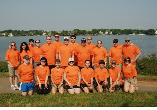
The Ci Sea Dragons team photo

Dragons," competing against almost forty other teams including