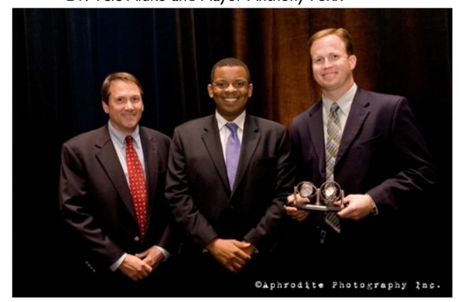
Shred–It and Mayor Anthony Foxx