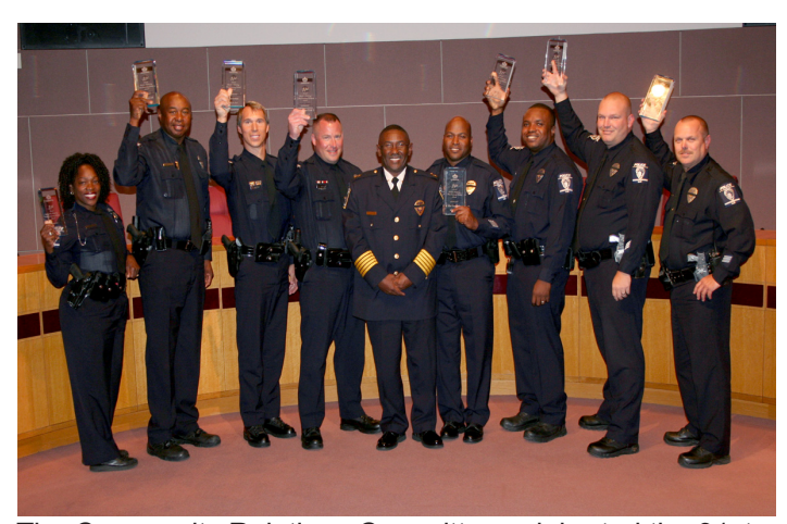
The Community Relations Committee celebrated the 31st Annual Police Community Relations Awards on Friday, May 14, 2010.