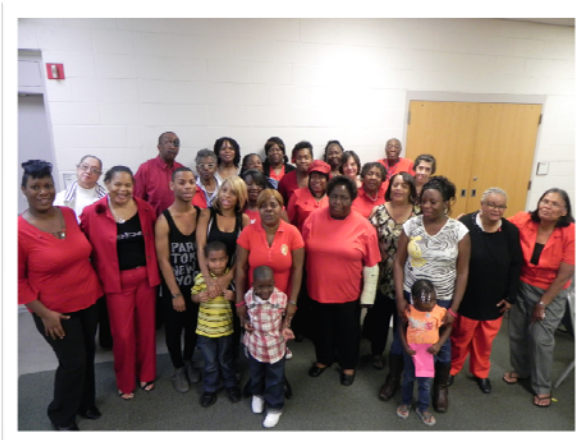
With Every Heart Beat is Life Instructors and Graduates

The event was held on October 13, 2010 to recognize and celebrate graduates of the Charlotte Housing Authority's With Every Heart Beat Is Life Program. The program is taught through an 11-week curriculum that is designed to be a fun and informative introduction to healthier eating habits, cardiovascular disease awareness, disease prevention, and motivation of increased physical activity. Through these activities, the program teaches CHA residents how to promote healthier living in their own communities.