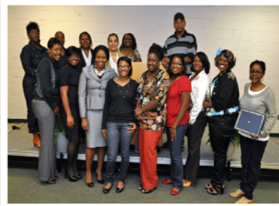
Family Self-Sufficiency Graduates

The event was held on October 7, 2010 to celebrate 27 graduates of the Charlotte Housing Authority's Family Self-Sufficiency Program. The program helps families identify and remove the barriers that prohibit them from becoming financially independent and self-reliant. By having access to supportive services, such as educational and vocational training, families are able to transition from dependence on government benefits to a level of personal earnings that will allow them to provide for their own needs.