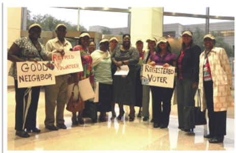
Unified Voice Participants at City Council Meeting

On September 27, 2010, Charlotte Housing Authority (CHA) Section 8 participants and CHA employees gathered at the City Council Public Forum to dispel myths in the community that Section 8 participants bring crime into neighborhoods and decrease property value. The initiative is the Unified Voice Campaign.