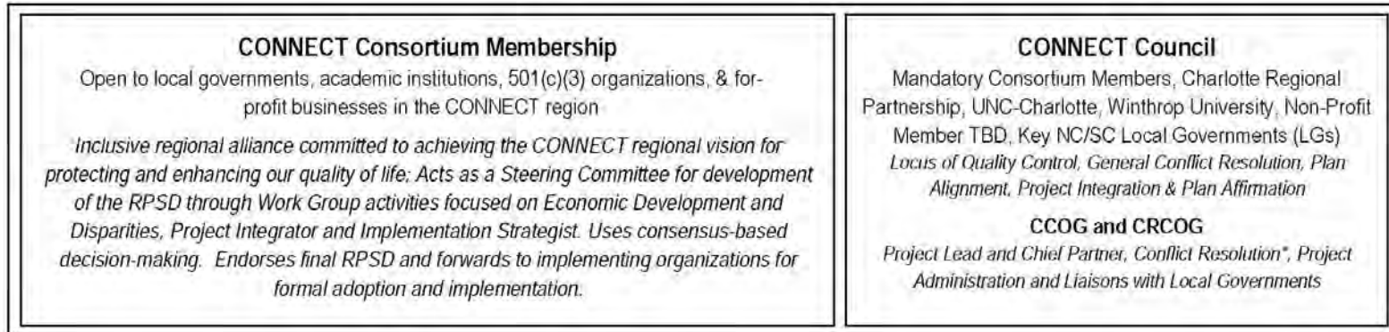
Exhibit A: CONNECT Consortium Organizational Structure, Member Roles, and Decision-Making Flow