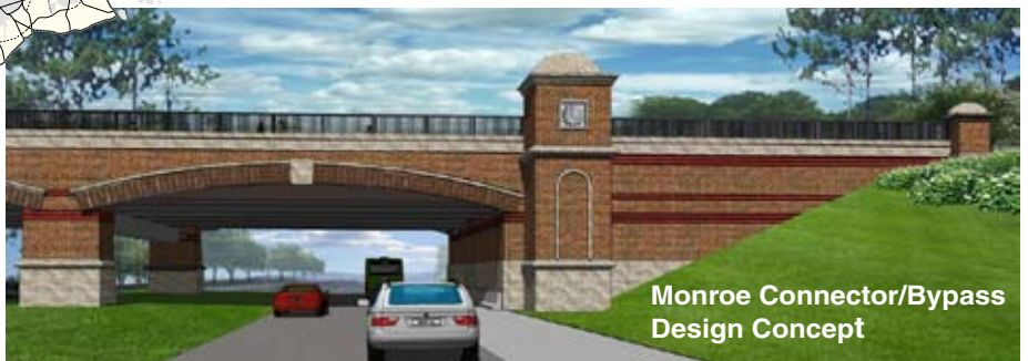
Monroe Connector/Bypass Design Concept

The North Carolina Turnpike Authority (NCTA) has received the Record of Decision from the Federal Highway Administration, which signifies the final federal approval for the project's route. Now that the project's route has been determined, the next steps include using preliminary designs to establish a list of properties that are clearly in the right-of-way and contacting the affected owners, and opening the Design-Build bids and announcing the selected team in October, at which time NCTA can move forward with finalizing its financial plan. The goal for awarding the project's design-build contract is December, and the project is anticipated to open to traffic in 2014.