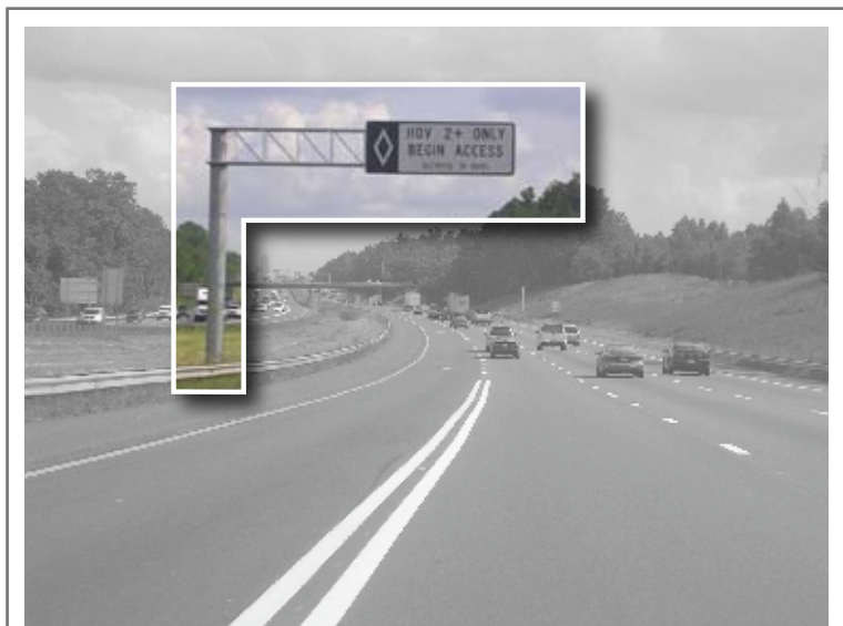
High Occupancy Vehicle (HOV) lanes like the one above could be replaced by High Occupancy Toll (HOT) lanes.

The North Carolina Department of Transportation (NCDOT) continues to work with MUMPO to determine how high occupancy toll (HOT) lanes could be implemented on I-77 north, approximately from 5th Street in Charlotte to Exit 28 in north Mecklenburg County. Several scenarios have been identified and studied, including the pursuit of a private public partnership (P3) option. HOT lanes have been implemented in several cities across the country, but not in North Carolina.