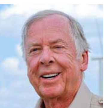
T. Boone Pickens pictured above

United States' dependence on foreign oil. The premise of the