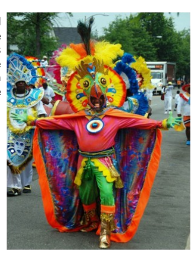
Performer at the Caribbean Festival

With Charlotte's West Indian population perpetually growing, we continue enjoying the