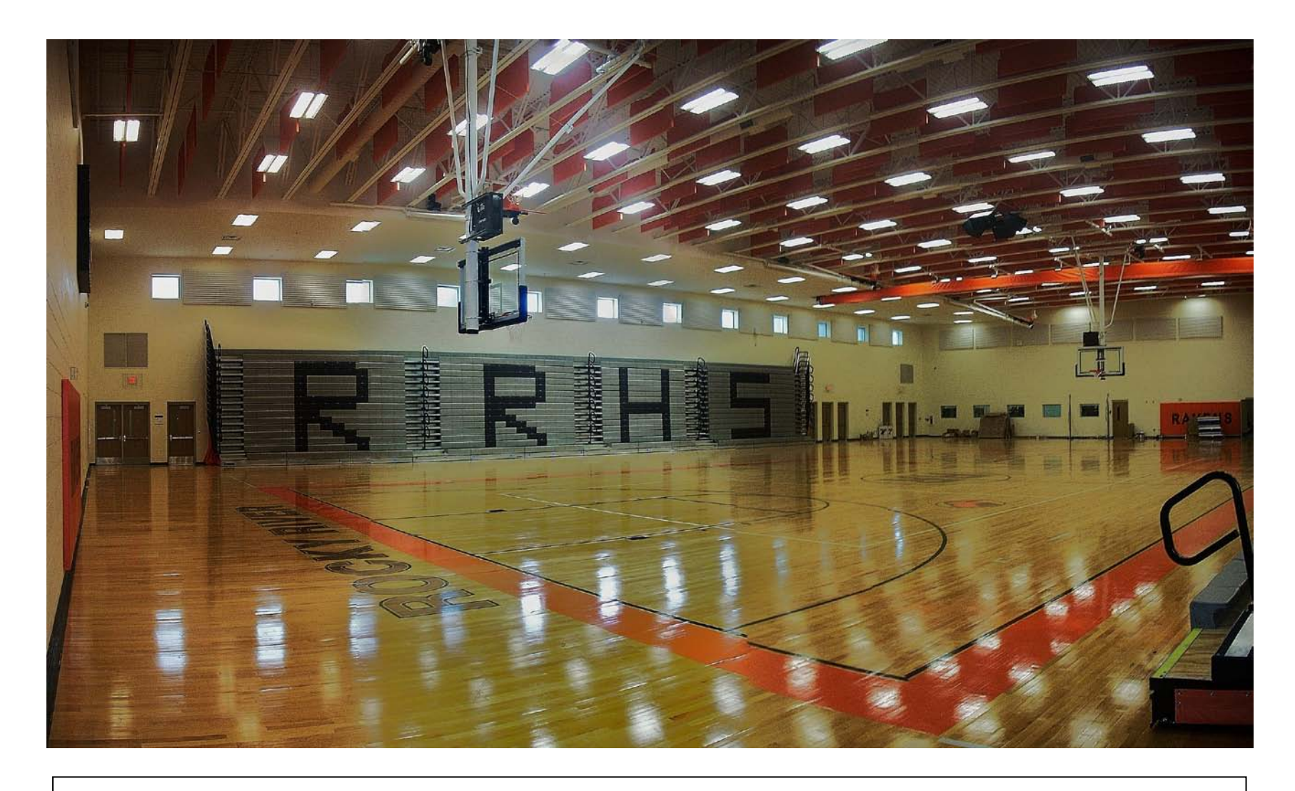
Rocky River High School (H07-01) Gymnasium