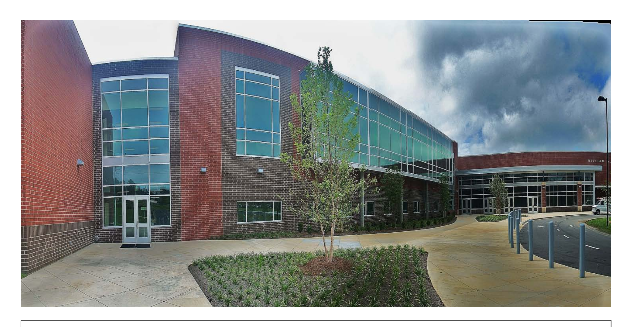
Hough High School (H07-02) Main Entrance