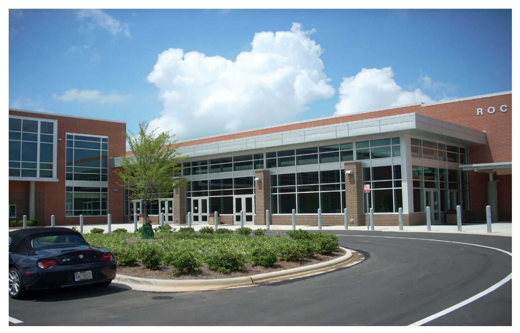
Rocky River High School (H07-01) Main Entrance