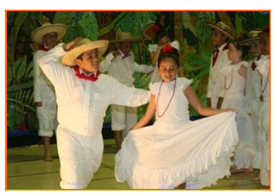
Collinswood Language Academy students perform in native costumes during International Week