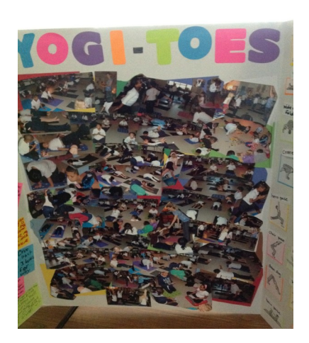
Montessori students learn how all life is connected during Earth

Yoga poses involve a combination of stretching, breathing and mental relaxation which will be used by our students with upcoming CMS testing. Many yoga poses have names that draw on elements of nature (animals, landmarks), which can intrigue children and