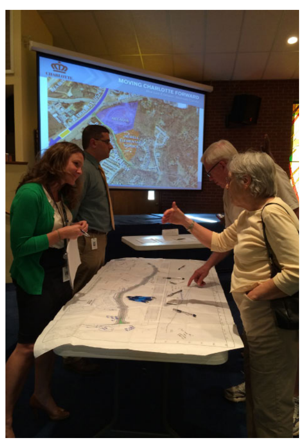
Speaking to the community at a public meeting at Newell Presbyterian Church

A community meeting was held for the Rocky River Road West Streetscape Project on August 26, 2014, at Newell Presbyterian Church. Approximately 50 citizens attended. The Rocky River Road West project will provide turn lanes for new developments taking place along Rocky River Road West, as well as provide sidewalk and bike lanes from North Tryon to Batavia Lane.