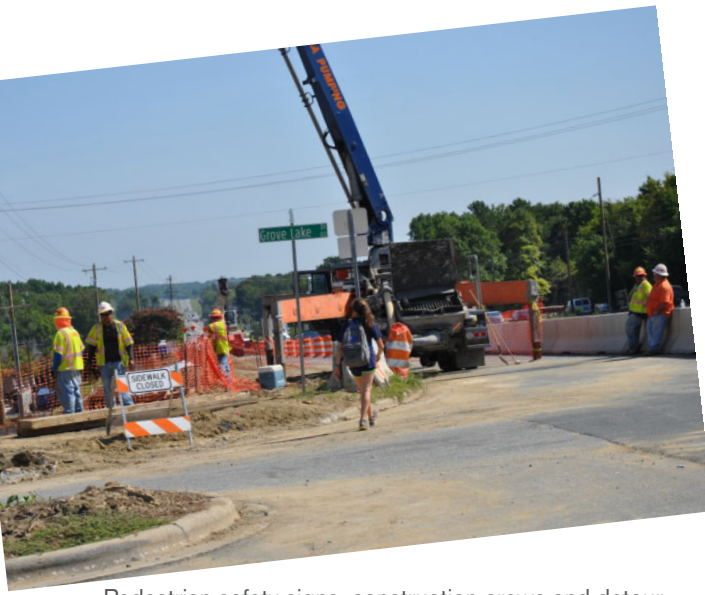
Pedestrian safety signs, construction crews and detour sidewalk on North Tryon Street and Grove Lake Drive

BLE construction is ramping up, and with that, pedestrian safety around construction zones is not only a hot topic but a vital issue.