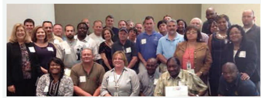
A renewed commitment to safety and risk management continued. CMUD staff racked up 2 dozen N.C. Dept. of Labor Safety Awards in May 2012.