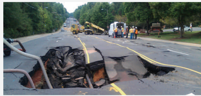
A shift from high growth focus to emphasis on system maintenance continued. CMUD faced a series of water main breaks along a stretch of 24-inch water pipe in south Charlotte, causing significant traffic problems and repair expense. After hydraulic studies deemed most of the 1970's-era pipeline no longer essential to the distribution system (thanks to infrastructure improvements of the past decade), most sections of line were retired from service over the winter.