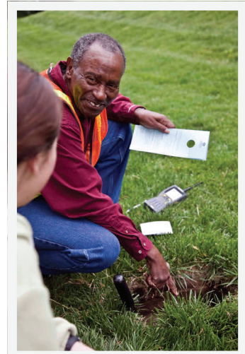
High bill investigations declined this year, thanks in part to more pre-billing quality control and improved communication.

Even in the tough economic climate, CMUD maintains competitive rates and earned AAA status last summer from all three bond rating agencies.