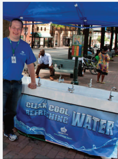
CMUD ‘test-drove’ a new mobile water dispenser during the uptown Speed Street festival in May 2012, giving a boost to the utility’s ongoing community outreach efforts.