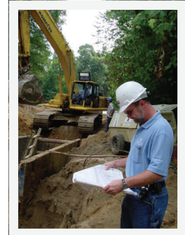
Growth has not stopped; CMUD added thousands of new accounts via annexation and saw an uptick in new service connection requests.