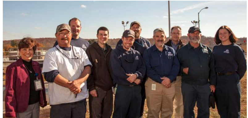
McDowell Creek Wastewater Treatment Plant Staff

CMUD and its Advisory Committee take great pride in our community's nationally accredited laboratory and eight award-winning treatment plants. Additionally, we are pleased to report that CMUD and the City entered into the contracted operation of five Union County wastewater treatment plants , effective June 1. Union customers, not CMUD customers, continue paying all costs associated with this contract yet the entire region and river basins benefit from the sharing of staff experience and proven,