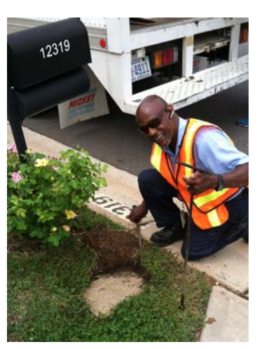
CMUD is moving towards the next generation of business systems integration, including meter technology.

includes the lowest average annual residential water/ sewer rate increase since the late 1990s (about