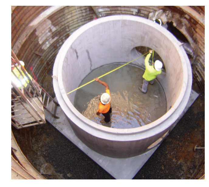
Tunneling crew installing a 10-foot-diameter manhole on Morningside Drive near the intersection at Commonwealth Avenue.

When activated, the new sewer line will provide needed capacity, reduce the risk of sewer overflows, protect the water quality in Briar Creek and meet demands for growth.